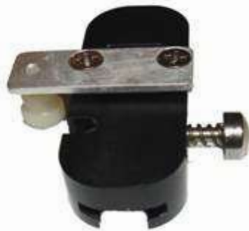
Slide with light INODIVE mount

The Clamp may also be tightened By inserting a small screwdriver through this hole