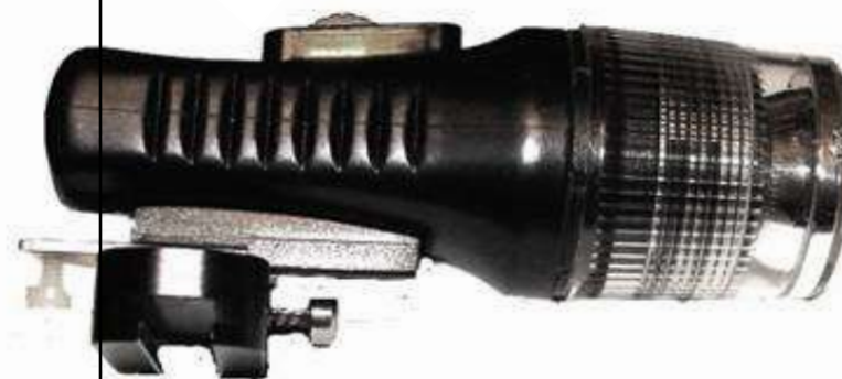
Slide light on to mount and secure with thumb screw

The mounting screw holes on the slide are offset. When installing the light mount to the slide, the slide release button will be on the opposite side away from the thumb screw hole as shown above.